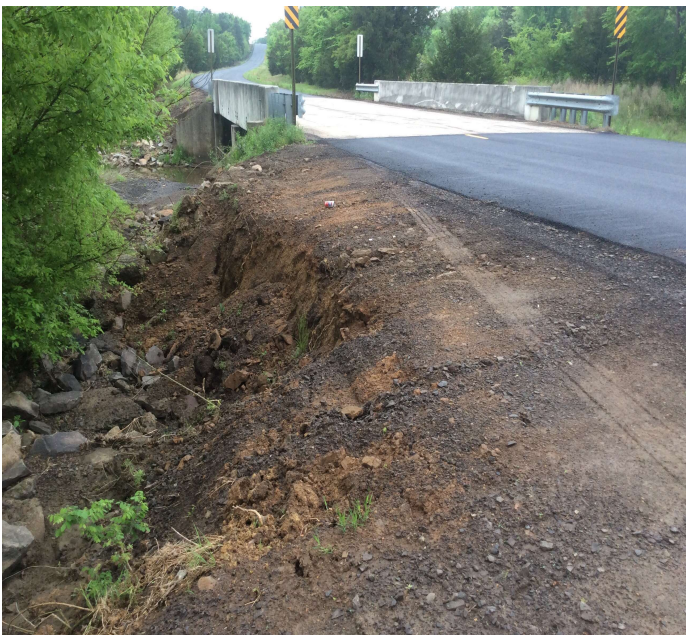
PHOTO 1 Description The Northeast embankment has erosion adjacent to the roadway.